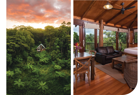
Rose Gums Wilderness Retreat Atherton Tablelands

Aimed at the discerning guest, Narrows Escape is a boutique rainforest retreat, with lavishly appointed, self-contained villas including private plunge pools, nestled in pristine rainforest. The Villas are perfectly positioned to take in the natural beauty of the lush sub-tropical rainforest in private luxury. Sustainability features include wastewater recycling, rainwater harvesting, energy-efficient lighting, and on-demand gas hot water. Narrows incorporates biodegradable cleaning products and composting to reduce environmental impact. Sourcing food produce locally and supporting wildlife preservation, the retreat creates an eco-friendly haven amidst nature's beauty.