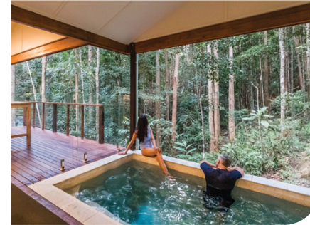
Narrows Escape Rainforest Retreat Sunshine Coast