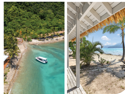
Elysian Luxury Eco Island Retreat Whitsundays

Luxury private timber & pole treehouses featuring spa-baths & fireplaces. Set in the Cairns Highlands adjoining World Heritage listed Wooroonooran N.P. in the foothills of Mt Bartle Frere, Queensland's highest mountain. This eco-tourist accredited retreat, with its own rainforest streams, waterfall and bush walks is an ideal getaway for couples and families. Rose Gums has always been committed to reforestation by planting over 25,000 mixed native trees and was declared a Nature Refuge by the Queensland Government Environmental Protection Agency. The retreat operates using sustainable electricity practices and sources water below the ground, providing year round clean spring water.