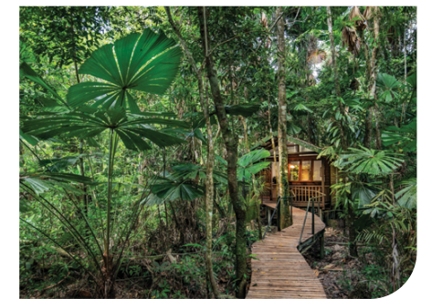
Daintree Wilderness Lodge The Daintree

Nestled on the southern tip of Long Island surrounded by dense national park, rainforest, and the turquoise waters of the Great Barrier Reef lies Elysian Retreat. A place of barefoot luxury and indulgence where a small personable team passionately showcases 5-star service, and that luxury need not be compromised in the search for sustainability. Elysian Retreat is the first 100% solar-powered island resort on the Great Barrier Reef. Certified under the Ecotourism Program, the resort demonstrates its commitment to environmental and social sustainability.