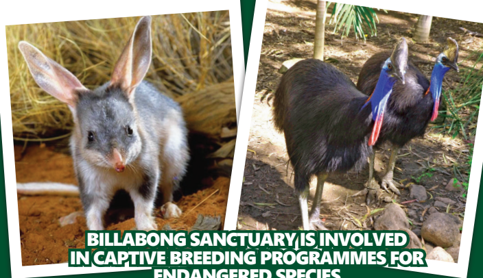
BILLABONG SANCTUARY IS INVOLVED IN CAPTIVE BREEDING PROGRAMMES FOR ENDANGERED SPECIES

There's lots to do at Billabong Sanctuary. Cool off in our tropical pool, relax on the verandas of the Blinky Bill Cafe where a tempting range of snacks and meals is on offer!